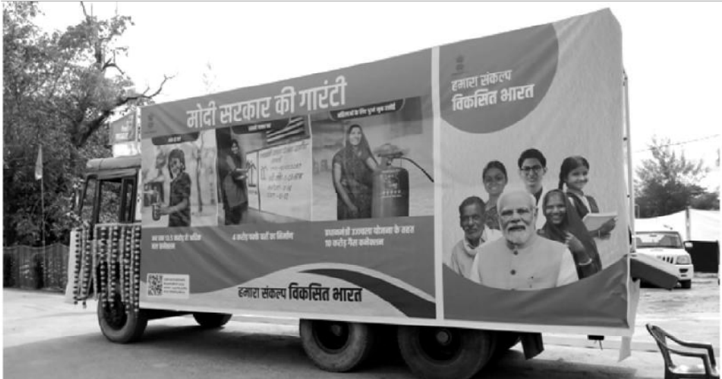
IEC Van launched at Campbell Bay to disseminate information on various Schemes of GoI

VBSY is the largest-ever outreach initiative of the Government of India